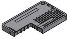
Flush Solid Cover