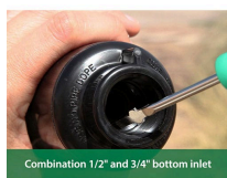
Combination 1/2" and 3/4" bottom inlet