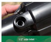
1/2" side inlet